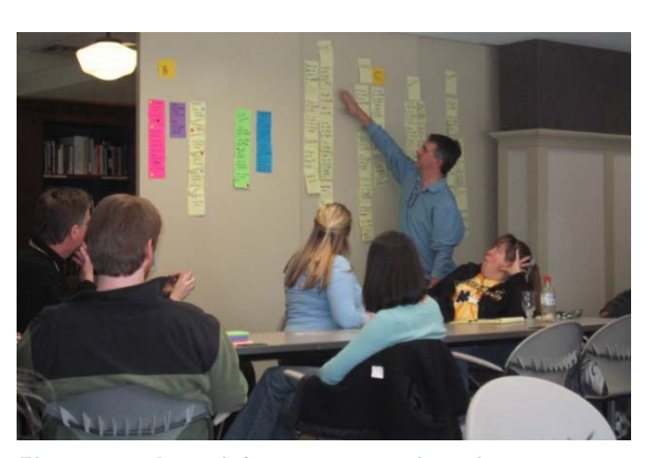
Figure 6. A parish team organizes improvement ideas to determine which have the greatest impact while not overtaxing the community's ability to put them into practice.