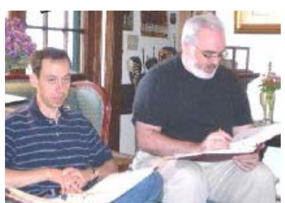
Figure 2 A parish ministry group develops plans for upcoming year.