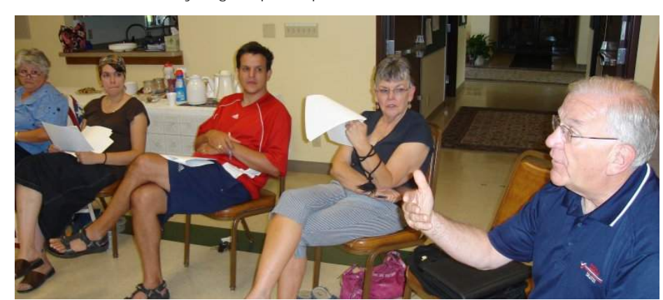
Figure 5 A primary value of the inventory may be as a framework for conversation and dialogue. Here a parish group discusses one section of the inventory model.

As mentioned previously there are numerous approaches that parishes can use to apply this model as an inventory of good parish practice.