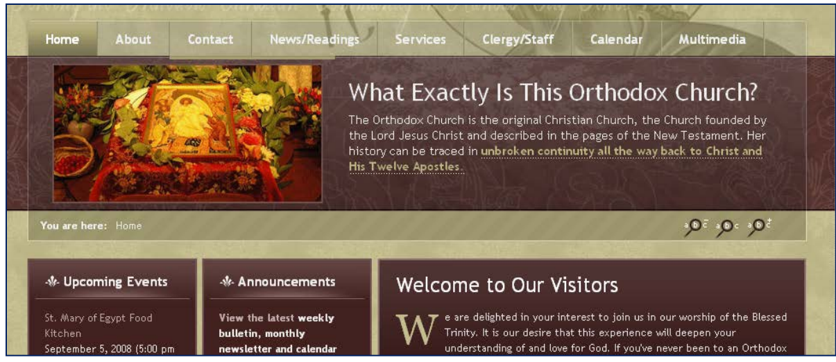
Figure 4 Parish websites are important tools for communicating awareness of a parish.